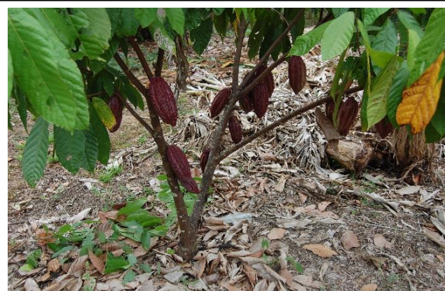
Cocoa pods on a 4 year old cocoa tree