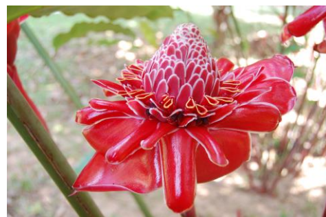
Etlingera elatior (Torch ginger)