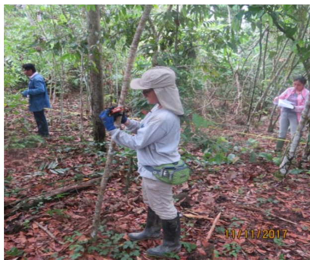
In the field

Betsy also suggests that regeneration could be enhanced through the selective planting of tree species that can rapidly provide shade and increase ground level humidity.