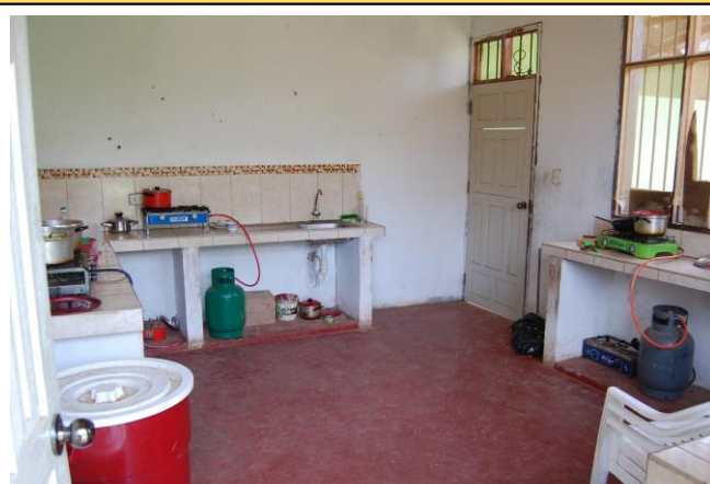
The shared kitchen