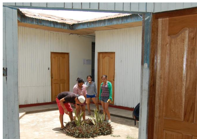
The central courtyard with the dormitory rooms off it

Appeal: £25+ to further improve the facilities in Casa Miraflores.