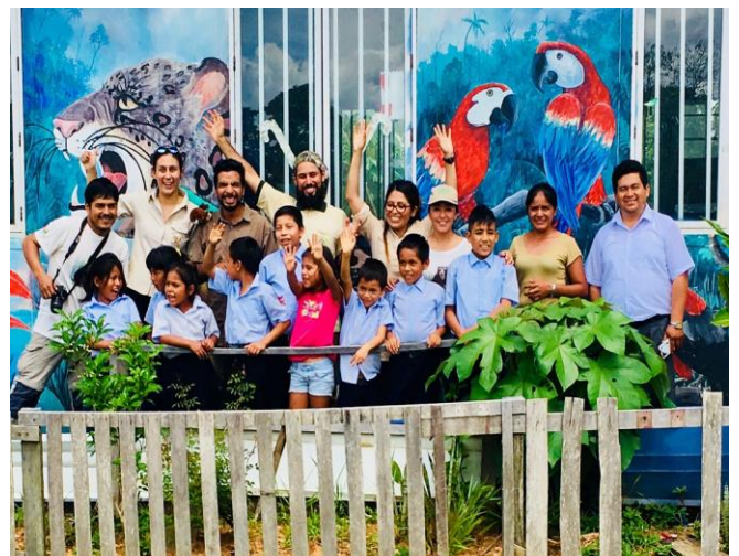
Giving an environmental education class at a primary school near the Jorge Chavez guard post