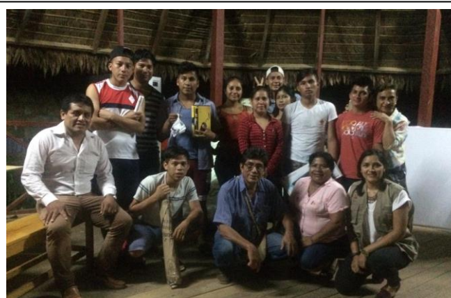
Students, FENAMAD & TReeS representatives at the donations handover ceremony