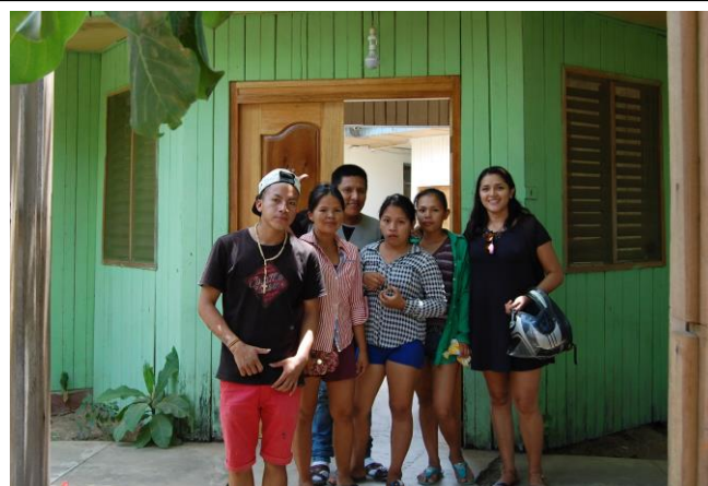
Students with the FENAMAD co-ordinator