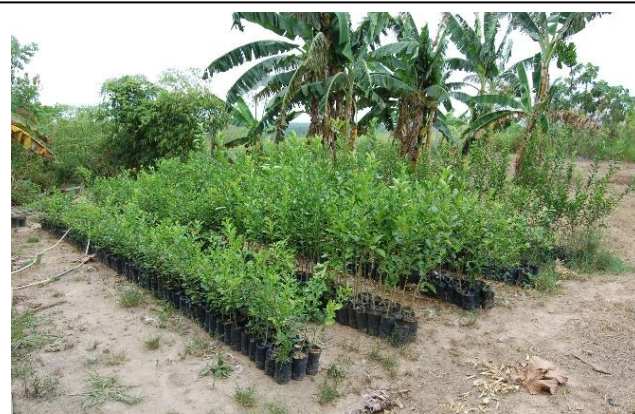
Approx. 2,000 seedlings - raised from seed - ready for planting out