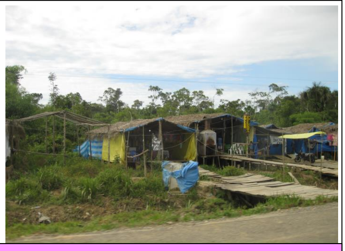
Informal miners homes along the Inter-Oceanic Highway

Paola Moschella (Beca recipient 2010) : 'Ocupación y uso del territorio en la quebrada Guacamayo, Madre de Dios' - a study of land use and perceptions of the environmental impact of gold-mining in the Guacamayo drainage basin. In total Paola made four visits to the Guacamayo area to conduct interviews and surveys, take river water samples and GPS readings, between 2009 and 2011. She was able to map the changes that have occurred since 2007.