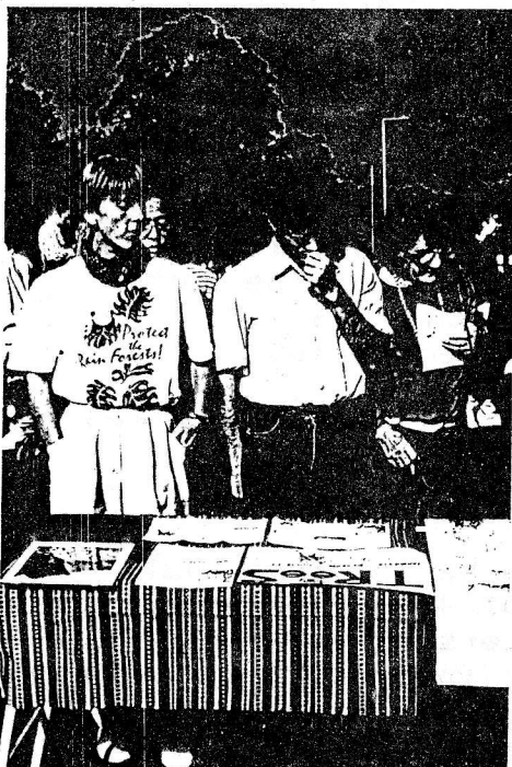
The Trees Stall at Friends of the Earth's Ark Day